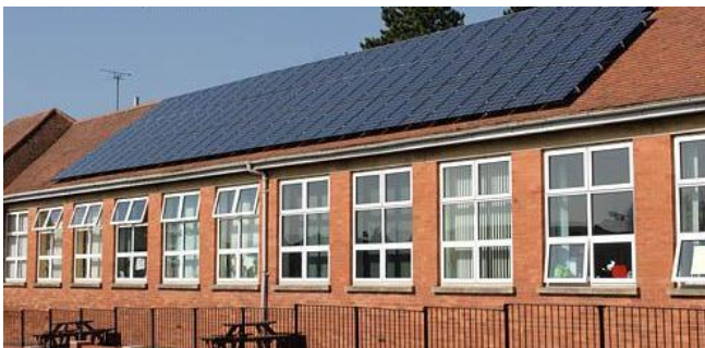
A school in Devon with photo voltaic cells installed on the roof.